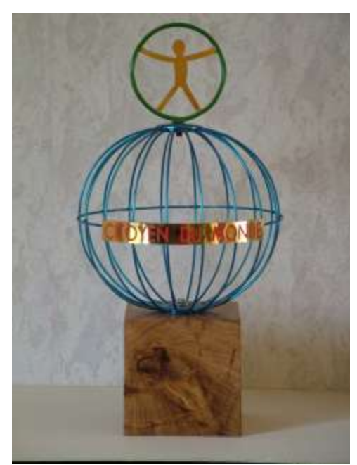
Maquette de stèle de mondialisation par Henri Cainaud.