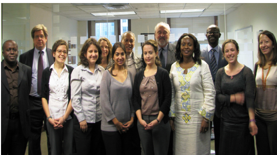
ICRtoP Steering Committee