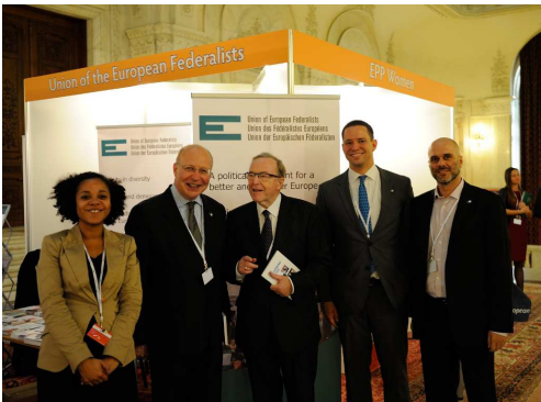
UEF Congress team with Wilfried Martens, EPP President